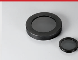
Polarizer analyzer attachment