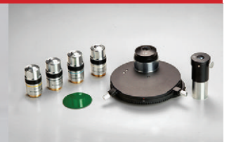
Phase contrast attachment