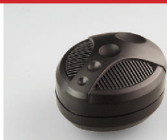
Digital camera attachment