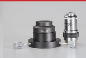
Dark field attachment