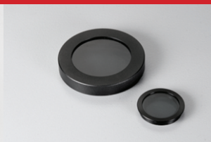
Polarizer analyzer attachment