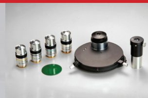
Phase contrast attachment