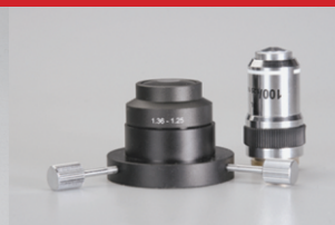
Dark field attachment